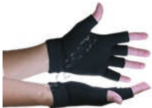
Open Finger FIR Gloves

Then you could use a pair of our Arthritis Gloves: